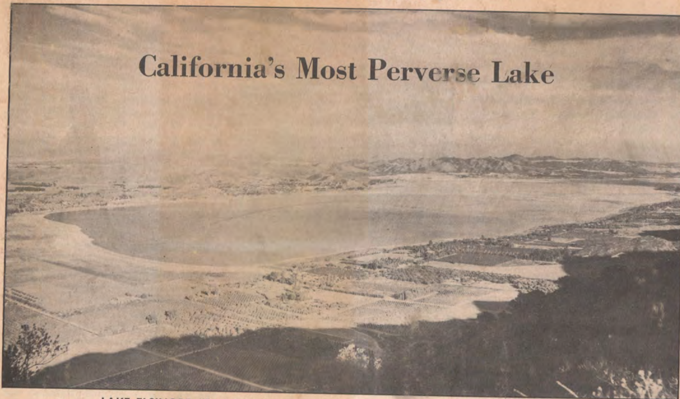
LAKE ELSINORE: "Joyful shouts metamorphosed into prognostications of eternal gloom . . ."

THE CLIMAXING feature of the Ortega Highway, which twists its way inland from San Juan Capistrano to Elsinore, is Inspiration Point. The view sweeps away breathtakingly from lush citrus groves at the base east across a plain as flat and verdant-green as a billiard table to the deep blue of the distant mountains. Dominating this vast bowl is beautiful Lake Elsinore, the most perverse, unruly and quite unpredictable body of water in California.