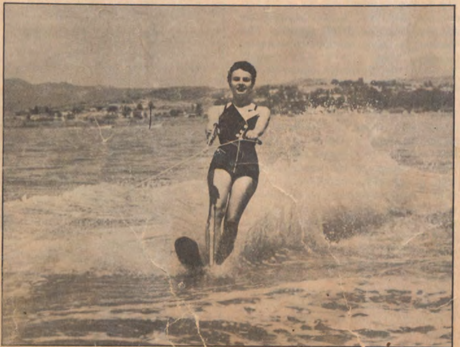
LAKE ELSINORE THEN: "It is to Elsinore Valley what the Alps are to Switzerland, or the desert to Arabia..."