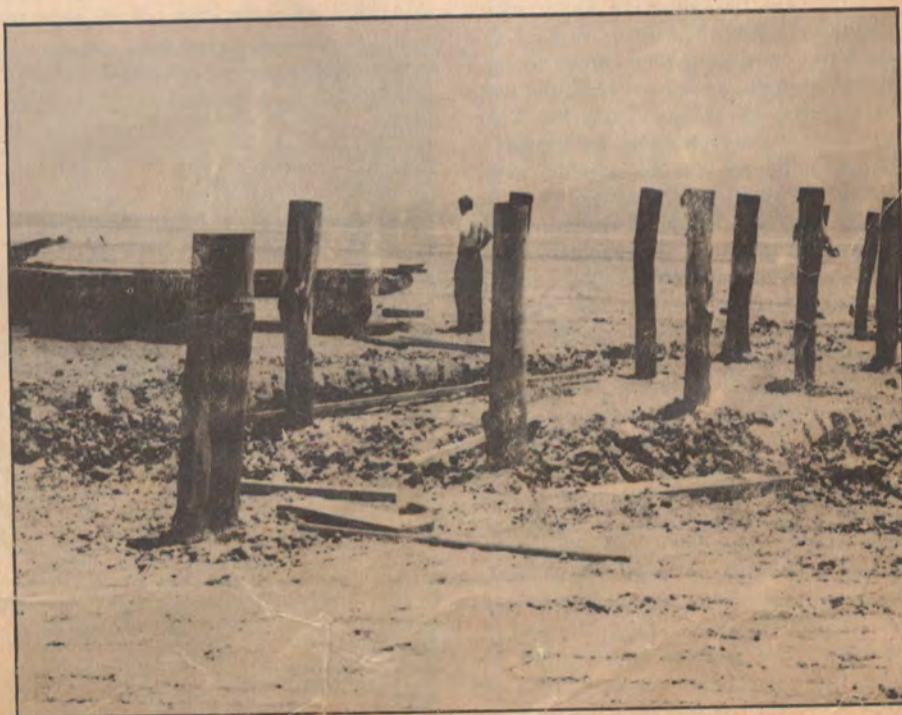
LAKE ELSINORE'S BOTTOM:

One of Elsinore Valley's poets, Evaline Morrison, expressed the feeling well when she recently wrote in the Elsinore Sun : "Lake Elsinore, full or dry, but still our Lake. It is to Elsinore Valley what the Alps are to Switzerland, the desert to Arabia."