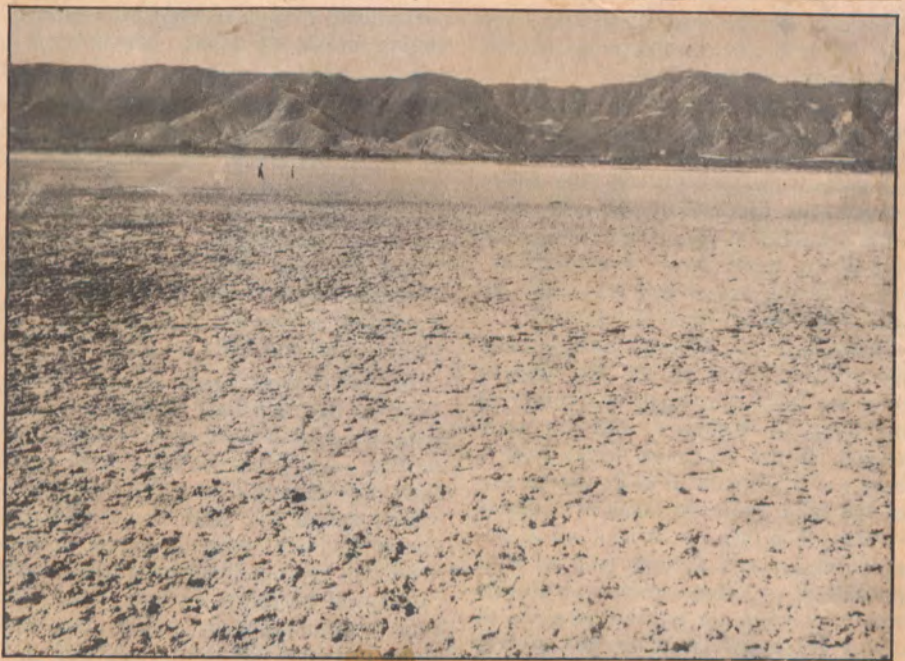
LAKE ELSINORE NOW: "Cool blue waters transformed into a barren sea of pitted, pock-marked earth..."

astute poker player in finances as well as cards, has a few aces to play before he is through, and one of them may be to maneuver his opposition so that they will buy out his academy, and pay him a fat price in the bargain. If that fails, he may turn the Academy into a non-profit educational institution. That way, when the State takes over the lake, his land evaluation will rise considerably while his taxes will go down.